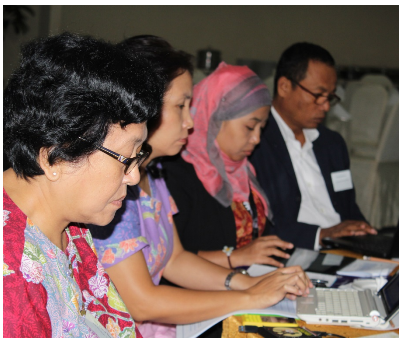
Group Interactive session at Jakarta Workshop 20 August 2014