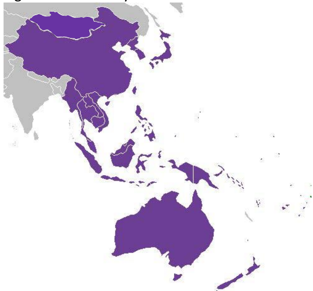
Figure 1: Case study countries

Atrocity crimes have left no part of the Asia Pacific region untouched. From the killing fields of Cambodia to the massacres that accompanied China's Great Leap Forward and Cultural Revolution, the Asia Pacific's recent past abounds with examples of genocide and mass atrocities committed against unarmed civilians. A quarter of Cambodia's entire population died during three and a half years of Khmer Rouge rule (1975-1979), a similar proportion of East Timor's population perished under Indonesian occupation (1975-1999), North Korea lost a quarter of its population to the Korean War (1950-1953), and researchers now count the victims of Mao's rule in China not in the millions but in the tens of millions. For much of the twentieth century, East Asians were at greater risk of death by genocide or mass atrocities than any peoples anywhere else in the world. Civilians were intentionally killed in vast numbers in the region's many Cold War proxy conflicts. They were killed to consolidate new states by demonstrating its brute power and coercing opponents. They were killed by opponents to these states. They were killed to physically eradicate domestic political opposition. They were killed to impose new ideologies. And, they were killed to establish – and dismantle – empires.